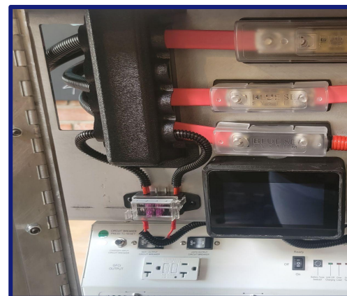
SMART Hub Display