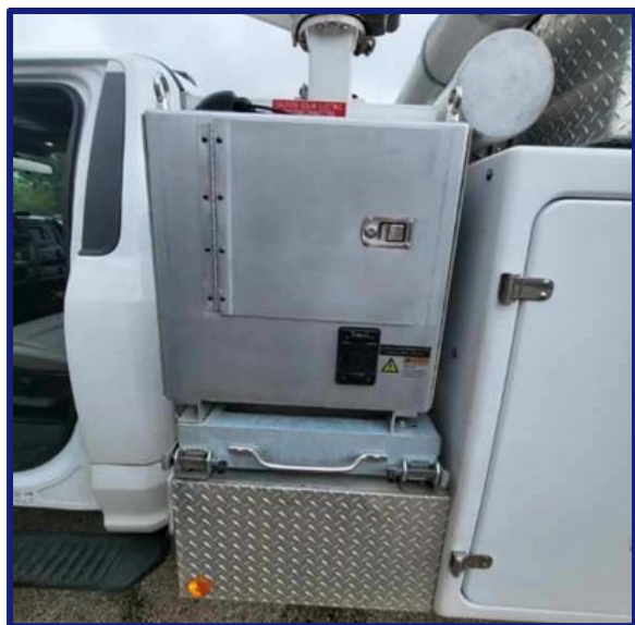
The Ultimate Power Pod is located on the street side behind the driver.